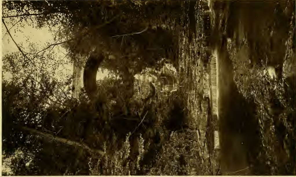
CENTRAL AVENUE BRIDGE OVER SOUTH GORGE